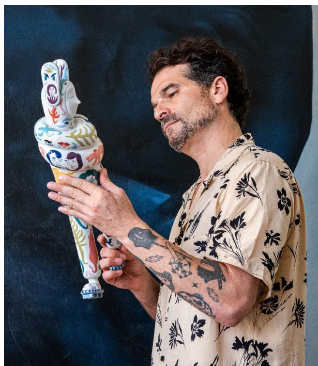
Designer Jaime Hayón

Doppia Firma spotlights the alliance between design innovation and the tradition of great master artisans not only from Europe, but for the first time also from other continents, such as Asia (with a project crafted in Pakistan) and Latin America (with the works of Colombian artisans), in order to generate a creative partnership between a designer/artist and an artisan, or a manufacturer of excellence. These one-of-a-kind objects are born from the cross-fertilisation between a design culture and a savoir-faire that is an authentic expression of its region of origin.